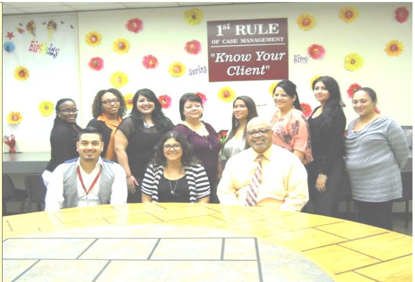
HR 360 PRCS Staff

The staff here at Health-RIGHT 360 work tirelessly to affect positive outcomes for the PRCS participants. We care! If you are PRCS, please know that if you want and need our help, we're going to be here for you! Whether it's Housing, Employment, Transportation, Bus Tokens, getting documents for identification, or more, we are going to help you to the best of our ability! All we ask is that you be willing and ready to follow through with us all the way.